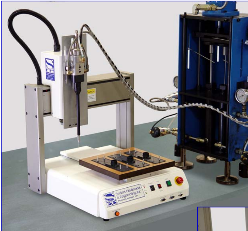
XYZ motion unit shown with See-Flo 690 2-Part Meter Mix Dispense System