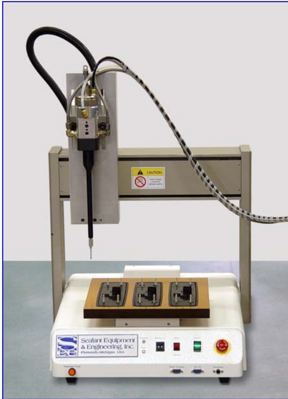
XYZ Robotic Dispense System