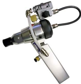
1270-783-000 Pneumatic Handle (Shown With 2200-727 Valve)