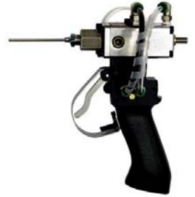
1280-230-000 Pneumatic Handle (Shown With 2600-041 Valve)