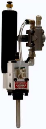
1270-658-002 Pneumatic Handle (Shown With 2200-245-125 Valve)