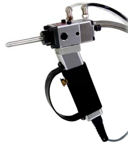
1280-229-000 Electric Handle (Shown With 2200-245-125 Valve)