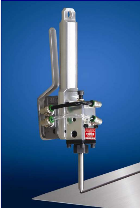
1270-857-000 Pneumatic Handle (Shown With 2200-245-125 Tip-Seal® KISS Valve)