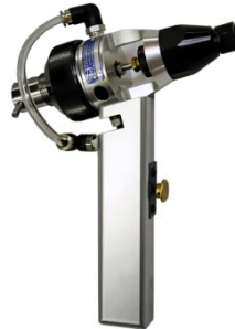
1280-231-000 Pneumatic Handle (Shown With 2100-480 Valve)