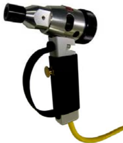
1270-715-000 Electric Handle (Shown With 2200-727 Valve)