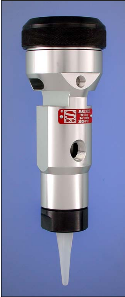
2200-033-000-AA Snuf-Bak Dispense Valve

2200-033 valves are designed for high volume automated applications using a medium to high viscosity, single component adhesive, sealant or lubricant. Its design is readily adapted to a robot end-of-arm tool or an automated fixture.