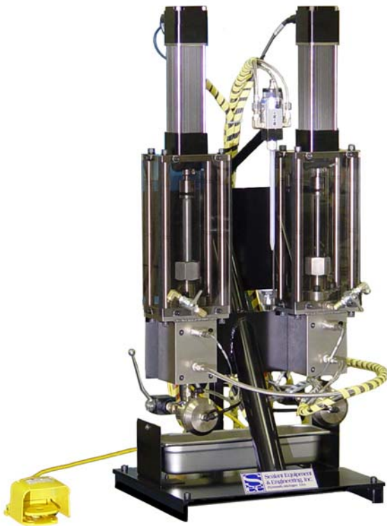
Servo-Flo 105 Variable Ratio Meter System