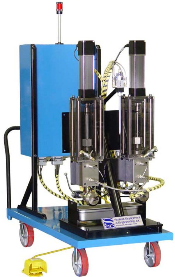
Servo-Flo 105 Meter System and Control Panel mounted on a portable cart