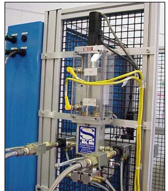
Servo-Flo 801 Meter System Mounted On Fence of XYZ Motion Dispenser

The air-over-oil drive and positive displacement meter allows complete user control over the amount that is dispensed and the material flow rate. The Micro-Meter 2 is readily integrated into automation equipment such as robotic or XYZ motion (shown).