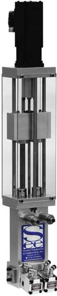
Servo-Flo 801-HV Meter with Integrated Flow Control Valves