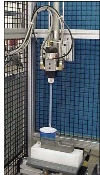
Gasketing Covers with a Remote Mounted Mix-Dispense Valve