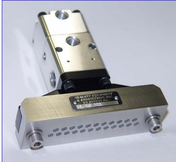
2200-245-132-AA MSA Applicator