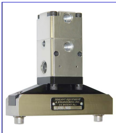
2200-245-132-AA MSA Applicator