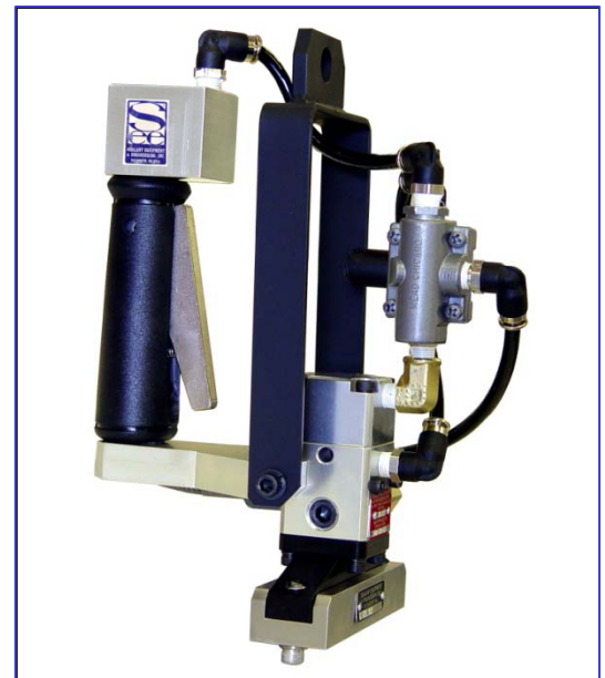
2600-020-000 Manual MSA Applicator